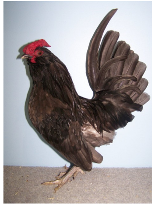
Bradley OLeary's Best Male Blue D'Anvers