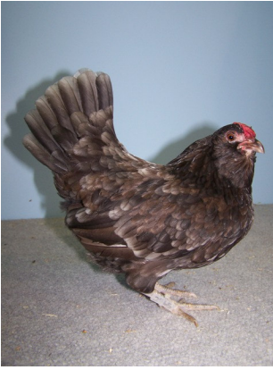
Bradley OLeary's Best Female AOC D'Anvers