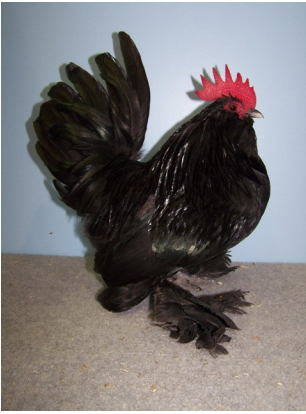
Dan McDonogh's Best Male Black D'Uccle