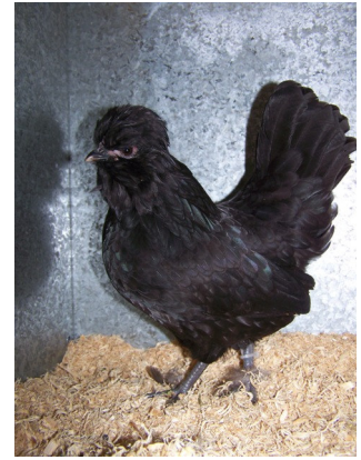
Sandra Fergusons Best Female AOC D'Watermael