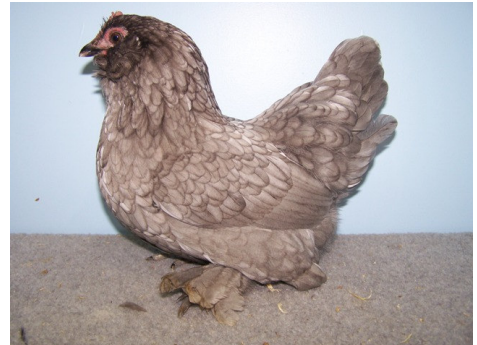
Bradley O'Leary's Champion Blue D'Uccle