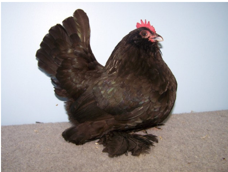
Dan McDonogh's Champion Black D'Uccle