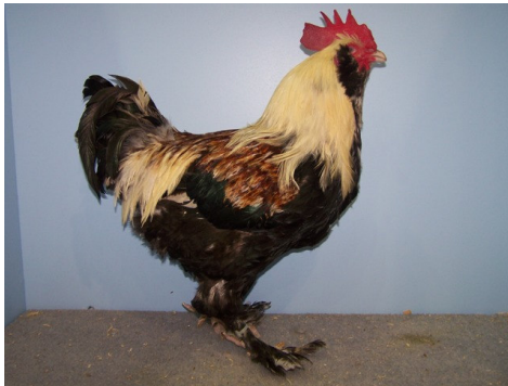
Sandra Fergusons Best Male Salmon Faverolles