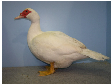
Sandra Fergusons 1st placed Under 12 months Muscovy Duck